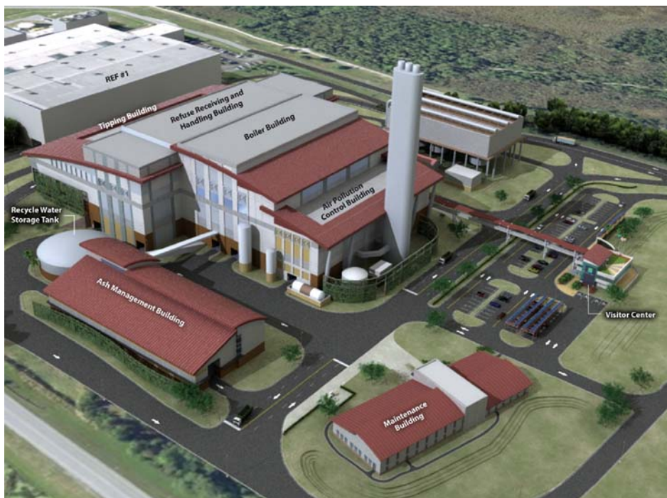
Figure 1. Proposed Rendering of Renewable Energy Facility #2

Harvested rainwater is a clean source of water that is low in minerals and suspended solids. This supply is variable and intermittent with the largest quantities anticipated during the rainy season, which runs from June to September. The first 2 in. of rainfall from each rain event will be harvested from approximately 7 acres of rooftop from a portion of the existing REF1 and most of the new mass burn facility (refer to the buildings labeled in Figure 1).